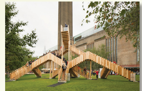
Endless Stair at Tate Modern